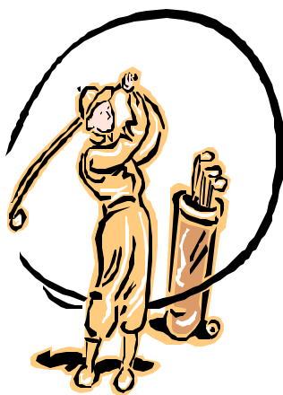
Stay in the Swing of Things Support BGC Events all year long

enjoy the game with friends. Relax with a bowl of chili and a cold beer while you play “football bingo” during the game.